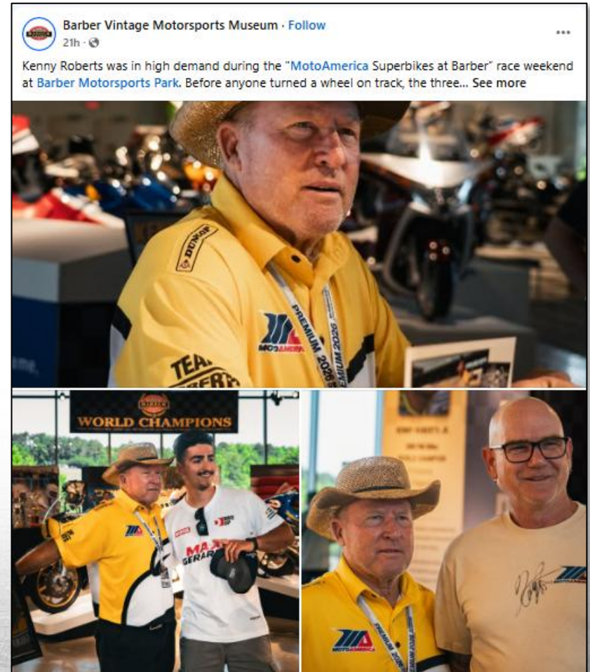
Barber Vintage Motorsports Museum · Follow 21h · 🌐 Kenny Roberts was in high demand during the "MotoAmerica Superbikes at Barber" race weekend at Barber Motorsports Park. Before anyone turned a wheel on track, the three... See more

Race legend Kenny Roberts was present at the Barber Museum and race event for various duties including interviews and oversight of the Team Roberts MotoAmerica Talent Cup team.